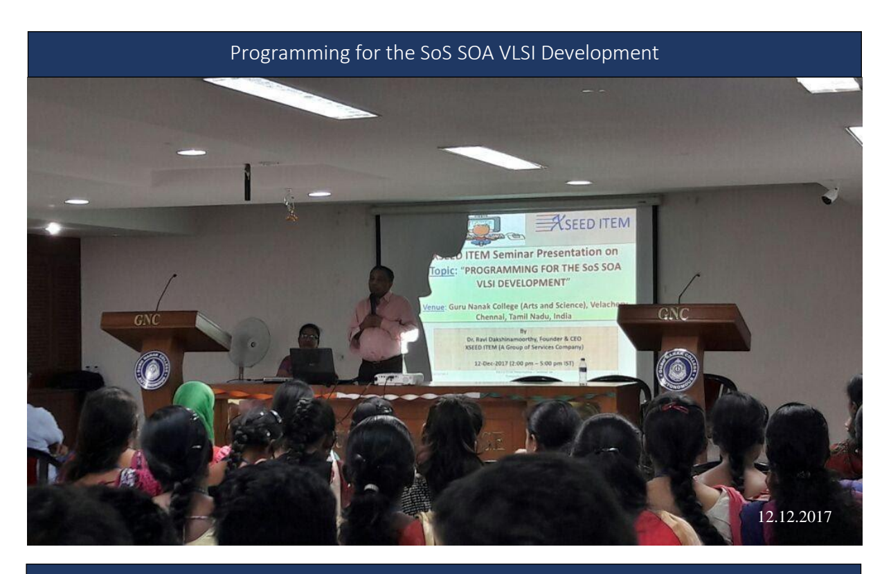
Programming for the SoS SOA VLSI Development